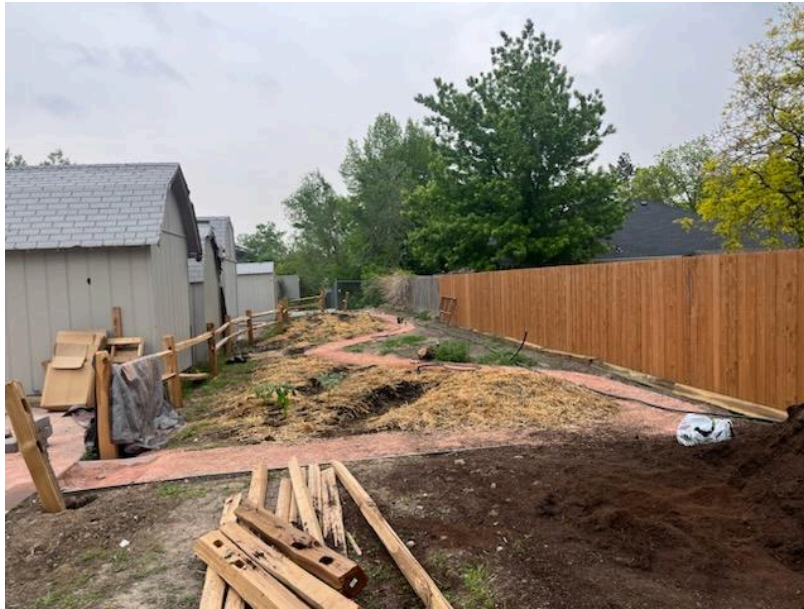
Link: school garden build production.jpeg