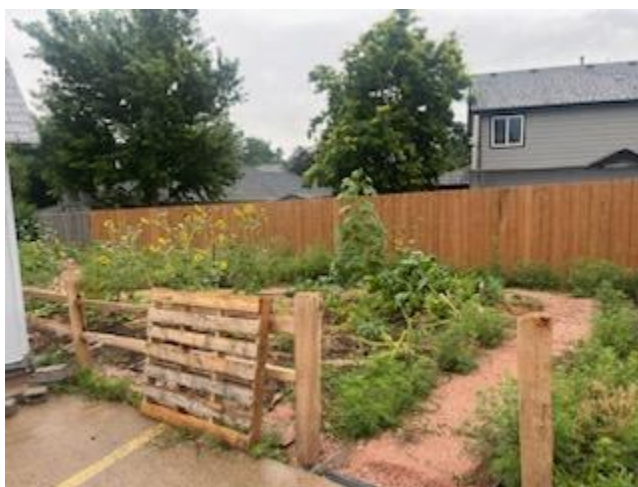
Link: school garden build final 1.jpg